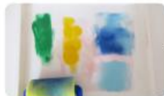
Use a roller to spread ink onto a printing tray.

Block printing uses a block with a pattern or motif carved into its surface. Ink or dye is applied to the carved surface, which is pressed onto fabric or paper repeatedly to make a pattern.