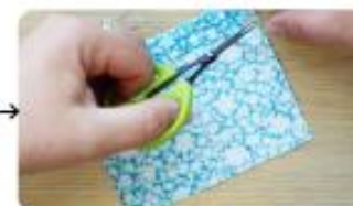
Tie a knot at the end of the hem and cut the thread. Iron along the crease to flatten the hem.