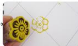
Press the block onto a piece of paper or fabric.