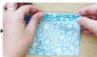
Turn the edge of the fabric over to make a 1.5cm hem. Pin it in place.