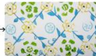
Repeat with other blocks and colours until the pattern is complete.