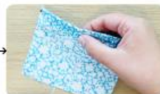
Use a needle and thread to sew running stitches along the hem.