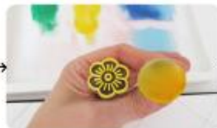
Cover the printing block with ink using a sponge or brush.