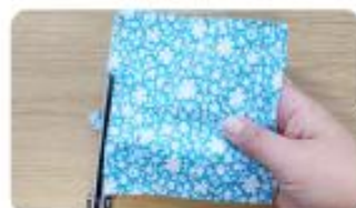
Trim the edge of the fabric with pinking shears.

A hem runs along the edge of a piece of cloth or clothing. It is made by turning under a raw edge and then sewing to give a neat finish to the fabric and to stop it from fraying.