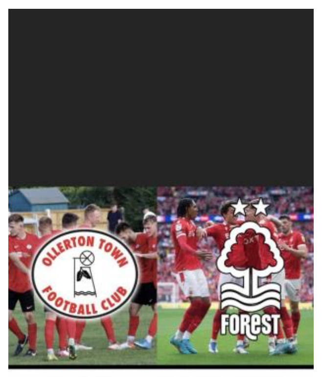
NOTTS SENIOR CUP 2ND ROUND TUESDAY 25TH OCTOBER 2022 7:45PM