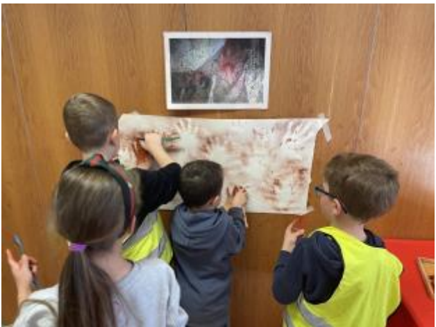
Year 3 have had a wonderful day learning about the Stone Age at Cresswell.